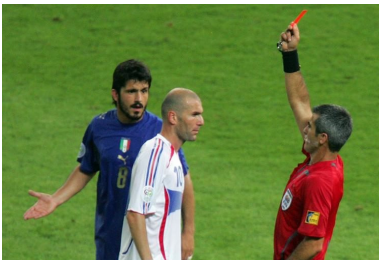
A trained official in action!

I look forward to our first meeting in March. In the mean time, stay healthy, get fit and most of all be willing to work...there are a ton of games coming up.