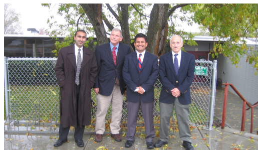
Happy, involved, LCSRA members.

LCSRA is your organization. If you consciously take steps to make it better it will be better and you'll feel empowered and connected to it.